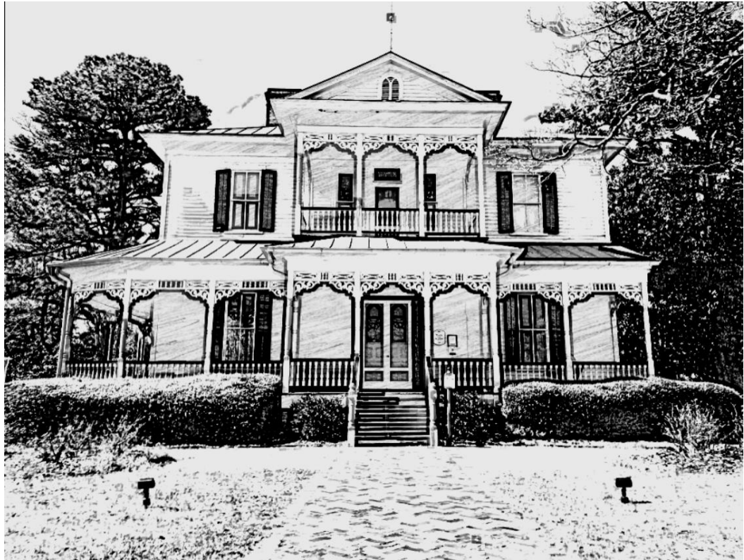
1897 Poe House.